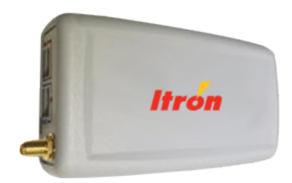
Figure 4: FSU

As part of the DA Development Kit, the following equipment will be supplied: Field Service Unit (FSU) - This hardware device connects to a PC via USB and allows the software to communicate with Itron devices over the radio network. Figure 4 contains a photograph of the FSU.