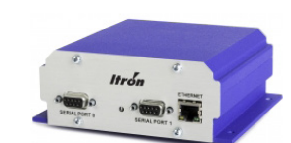
Figure 5: Master Bridge

Master Bridge – Itron hardware device that provides the gateway between the RF mesh network and the backhaul SCADA network. Figure 5 contains a photograph of the Master Bridge.