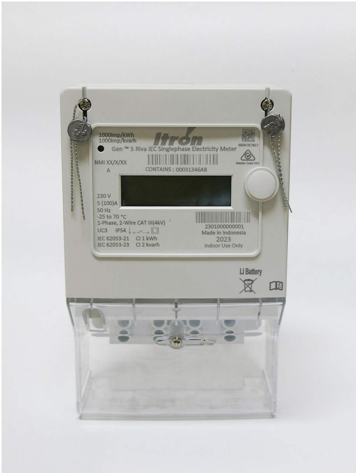
Itron Gen 5 Riva single phase electricity meter (the pattern)