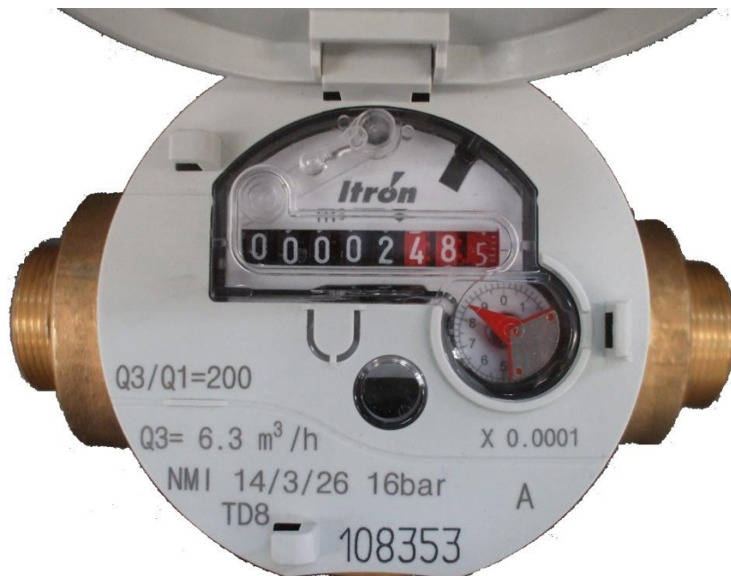
Indicating device and example of required markings