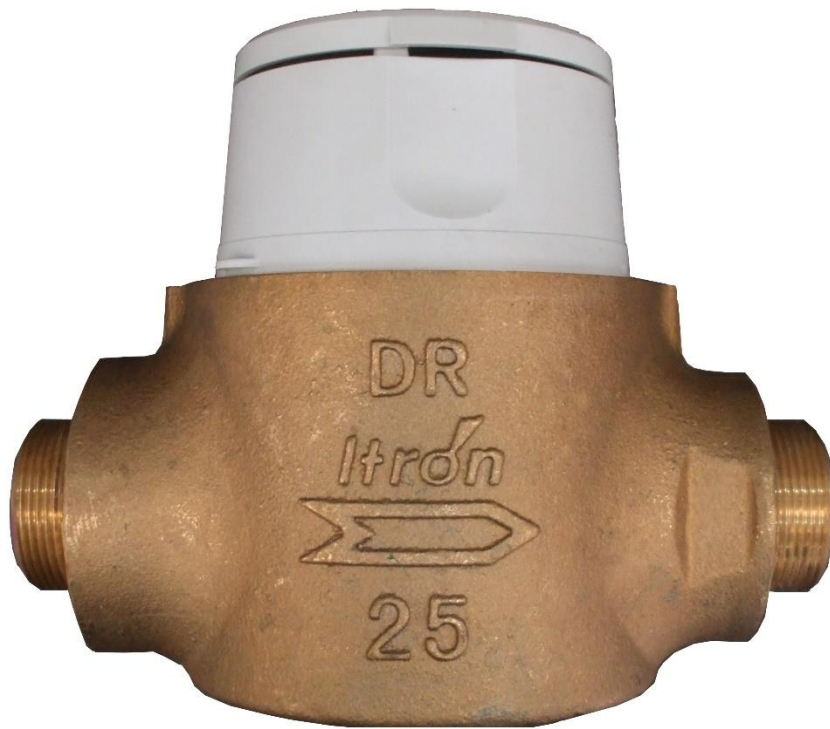
Itron TD8 DN25 water meter (the pattern)